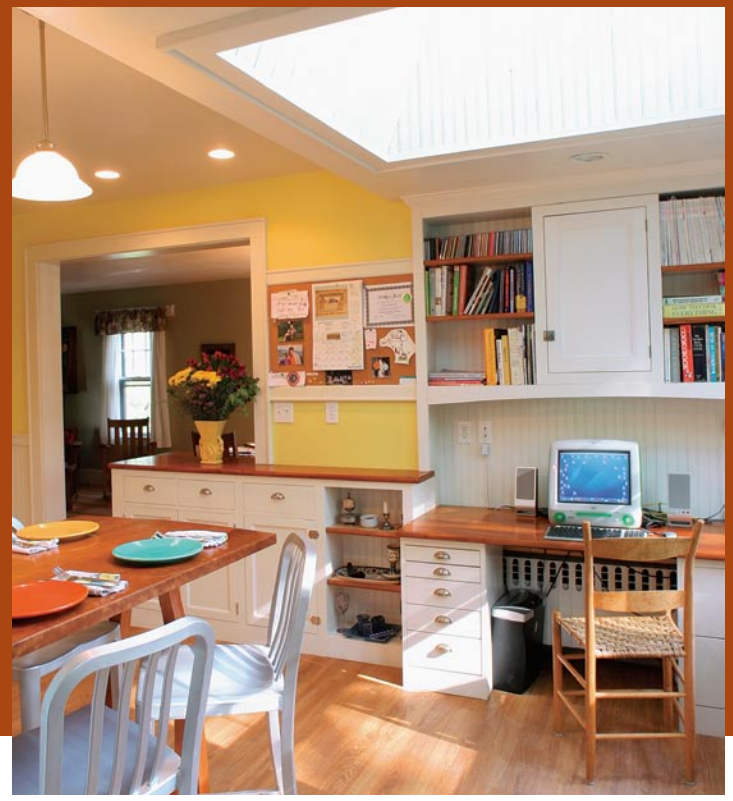
From just OK to Internet café. A computer workstation tucked into the corner and a bar-height dining counter turned inefficient spaces into hardworking places. Photo taken at C on floor plan.

is stationed here, serving as a homework and gaming center for the kids and as handy Internet access for anyone in need of a recipe. I took out the sagging shelves, which spanned more than 5 ft., and replaced them with a combination of open shelves for cookbooks and a cabinet for enclosed storage.